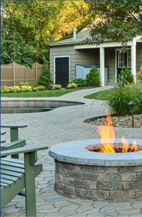
TECHO — BLOC INSPIRING ARTSCAPES